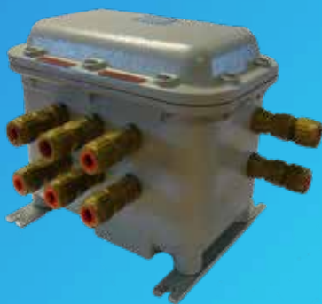
6 Channel, Ex Enclosure

Field display complies with ATEX and IECEx Zone 1 requirements. Produced in the UK from a manufacturer with over 15 years experience of designing and manufacturing solutions for explosive atmospheres.