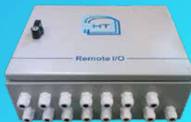
12 Channel, Wall Mount