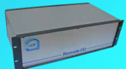
19" Rack Mount